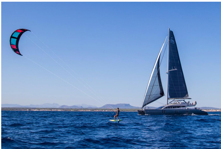
CARTOUCHE © STUARTPEARCE S168