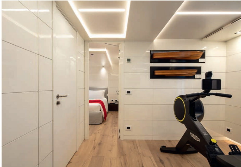
Above: the VIP cabin on the main deck has an en suite with a Japanese tub (below right).