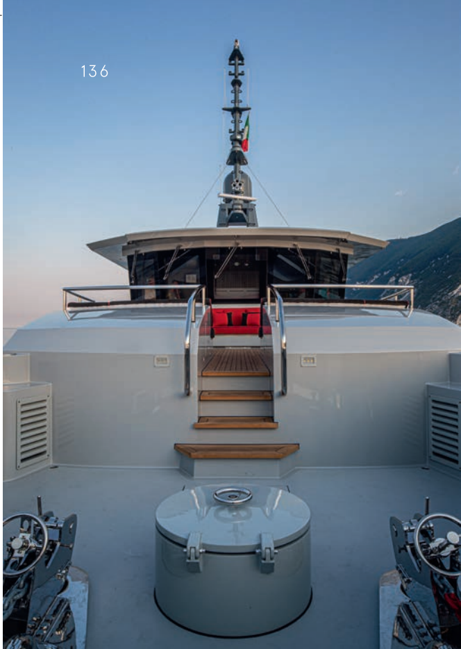
Above: K584's owners requested a masculine look with a military flavour, which was interpreted with a vertical bow and grey paint. Below: a guest lounge overlooks the mooring deck. Opposite page: the aft deck has room for a six-metre Tideman tender operated by a two-tonne HS Marine crane